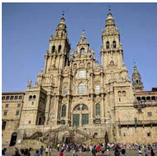
The cathedral at Santiago de Compostela.

Following Christ's Ascension, James is said to have taken the Gospel across the Holy Land and further afield in the Roman as well. He travelled and spread the Word as far as Spain, where he spent much time. James did return to Jerusalem and became the first apostle to be martyred for his faith - by King Herod. His body was not allowed to be buried, so his remains were taken to Compostela, Spain, by some of his followers. His remains were discovered in the ninth century and moved to a tomb in the place now known as Santiago de Compostela, in North-west Spain, where they can still be found in the Cathedral.