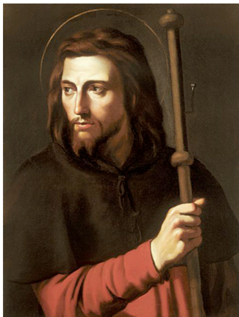
James the Great (anon)

Today, in our service, we hear two stories about St James, one of Jesus's first disciples: