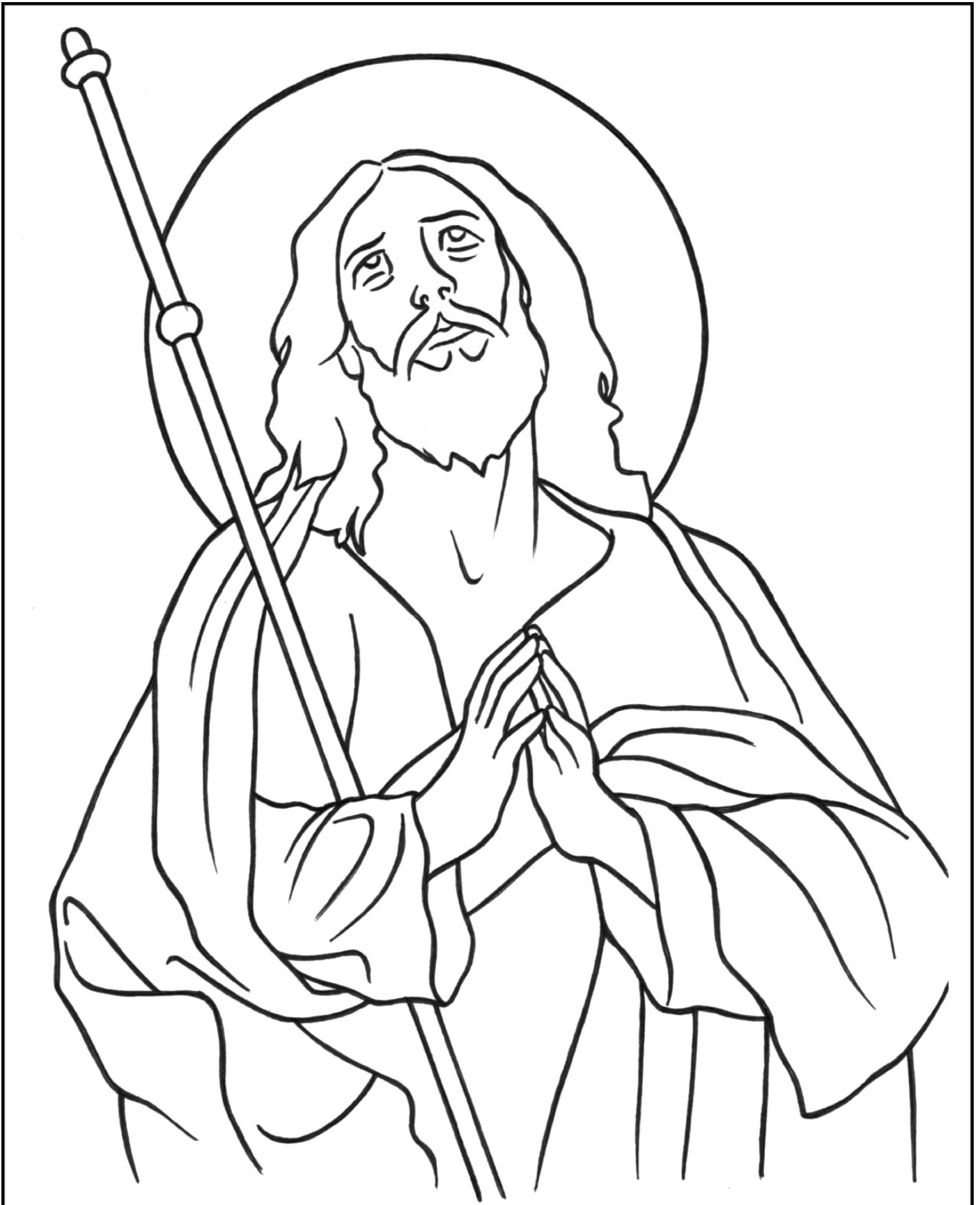
Saint James the Greater